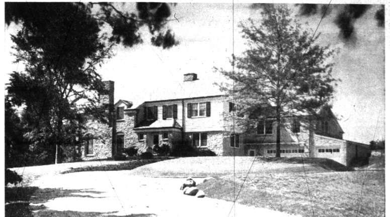
Beautiful old trees provide a perfect setting. The stone was specially quarried at Bayport, Michigan.

The Painted Desert in Arizona was our next stop. Temperatures rose steadily, it was as though all were dropped onto this place. But one glimpse of the GLOBES desert made my color fade into the background. The gorgeous coloring of the rocks and sands as far as the eye can see is breathtaking in beauty. Off in the distance the shading starting with delicate pink tones changing to red, to rust, to brown, then light green colors blending darker and yellows merging into orange make one think a mammoth box of wet paints had poured down from heaven and over the foothills of the mountains again. (See JOURNAL, Page 6, Part 2)