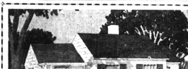
Will build you a home of two bedrooms and bath, living room; kitchen and dinette. Good heating plant—with or without basement, on F. H. A. terms. Monthly payments less than rent.

Two bulletins on water itch, containing blanks for application drags and screens, are now available at the commission's Lansing office. The commission's traveling field inspectors are available for inspections and consultation work. Flake sparks sail farther, after June 15.