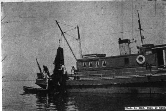
Michigan Patrol Boat No. 1, operated by the Michigan Department of Conservation, lifts a deep-water trap net set near the Lansing Shoal in northern Lake Michigan. The net was confiscated because it was set in water deeper than allowed by law and because the size of the mesh was smaller than permitted by law. The enforcing of regulations which control the operations of commercial fishermen in Michigan waters is an important duty of the Department.