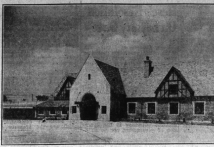
Here is a view of the Grand Trunk railroad company's Birmingham station, located at East Maple avenue and Eton road. It was completed in 1931 and is a direct line between Canada and western points. Several commuter trains run over it daily, between Toronto and Detroit.