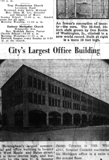
Birmingham's largest commercial and office building is located at West Maple and Bates street. It is three stories high, and was built by the late U. S. Senator James Couzens in 1928. While alive, Senator Couzens maintained his Michigan office in a suite on the second floor.