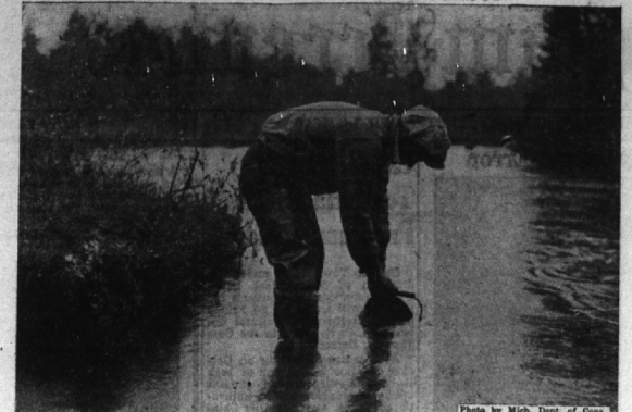
This operation, the final one in the rearing and planting of young trout, will be performed thousands of times during coming weeks as the fish division of the Michigan department of conservation empties its rearing ponds and plants nearly six million trout in Michigan streams. The trout—brook, brown and rainbow—will be six to seven months old and nearly legal size. More than 200 men will be engaged in fish planting operations. The above picture was snapped on the Jordan river.