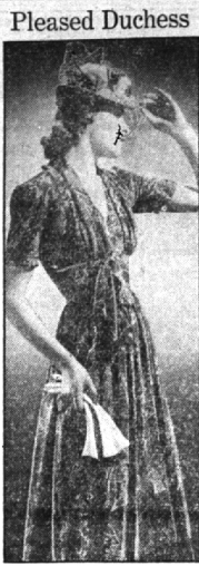
Pleased Duchess This afternoon frock, designed to be worn without a coat, is patterned after an original in the wardrobe of the Duchess of Windsor. Rural designs are faintly etched in white on the red silk crepe material. Other features: fitted waistline, shirred fichu front, flared skirt.