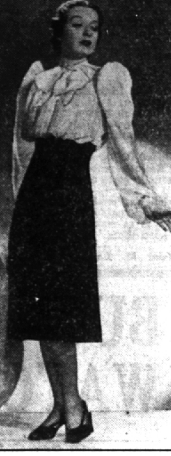
Contrasting black and white fashions, like that worn by Actress Patricia Morrison, are smart for summer. Skirt is of black wool. White crepe blouse is styled with long bishop sleeves, high tied neckline.