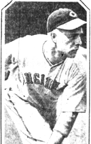
Johnny Vander Meer's feat of pitching two consecutive no-hit games was one of the high spots of the sports year.