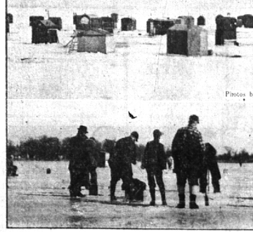
Top—Typical "shanty town" such as the many that spruce up on the lake when the ice fishing season opens. Left—Thousands of fishermen enjoy this winter sport on hundreds of lakes throughout the state. An investigation is being made this winter to gather data on how heavy the winter take of fish is and its effect on the supply.

"Better buy Buick!" EXHIBIT OF GENERAL MOTORS VALUE Sumner Motor Sales, Inc. 464 S. WOODWARD AVE.