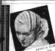
PATRICIA ELLIS Warner Star

FOR RENT Looking for small furnished home in the country about 6 miles from Birmingham, suitable for couple? Here is one that should be seen on hill looking on valley, about half hour from U. S. section. Phone 7050-4