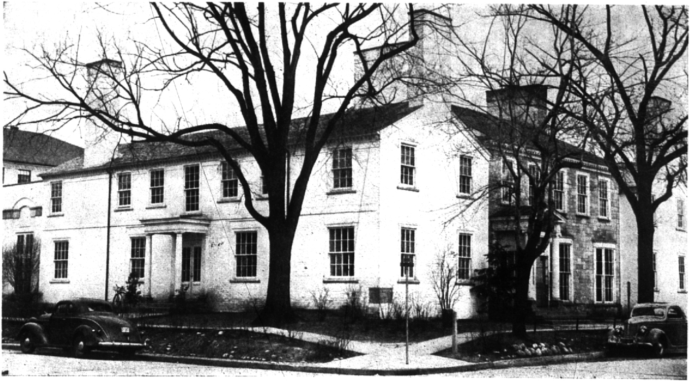
The Birmingham Community House