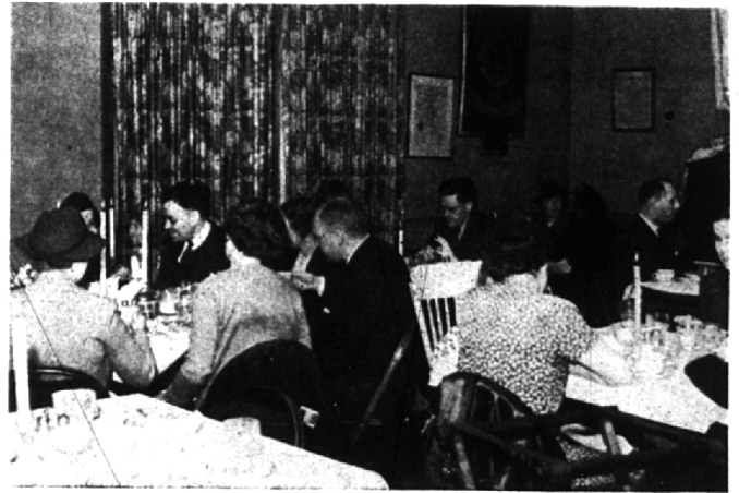
The Thursday Night Family Dinner