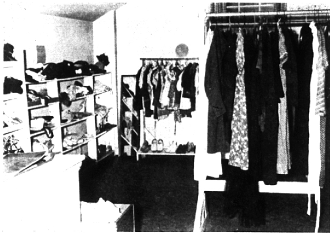
A Corner of the Thrift Shop