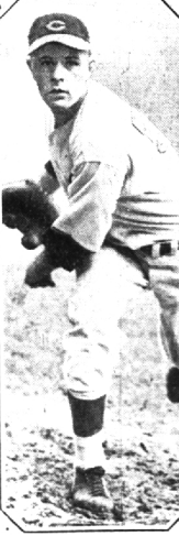
Johnny Vander Meer . . . watch Cincinnati go if he's okay.

E. W. OSBORNE FORD SALES AND SERVICE 808 S. WOODWARD