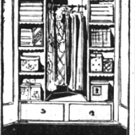
Plan of Bed Room Corner Closet

A convenient closet can be built in one corner of a room, making it a decorative as well as a useful feature.