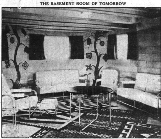
THE BASEMENT ROOM OF TOMORROW

Try an Eccentric Classified Ad for quick results.