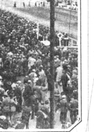
Victory smiled on young War Admiral, inset, for the second time in a week when he won the coveted Preakness at Pimlico, Baltimore, Md., a crowd shot of which is shown above. War Admiral already had won the Kentucky Derby.

War Admiral Proves His Greatness; but You 'Ain't Seen Nothin' Yet