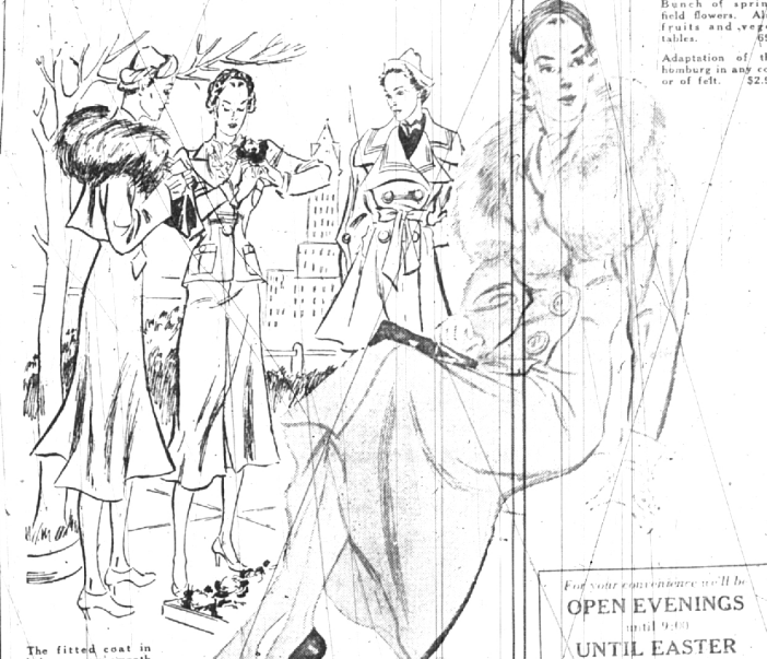
The fitted coat in beige or gray smooth woolen, with dyed-to-match fox collar. $49.95

For your convenience we'll be OPEN EVENINGS until 9:00 UNTIL EASTER