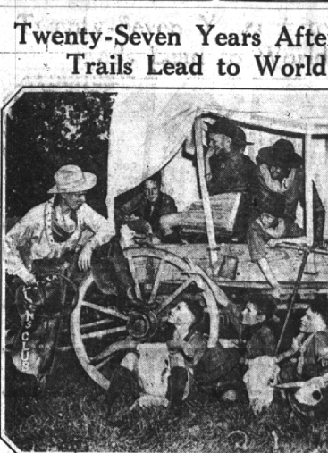
Commemorative gathering was the Boy Scout Jamboree in the shadow of the Washington monument. From the east, north, south and west they came. Typical representatives were those absent. Scouts from San Angelo, Texas, snapped as they sat upon their covered wagon listening to stories at the end of an exceedingly busy day.

Twenty-Seven Years After, Boy Scout Trails Lead to World Service