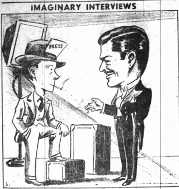
Cub: "How did you knock out your sparring partner, Mr. Gable?" Clark Gable: "Made his first cracker a day for ten months, and then took a peck at him."