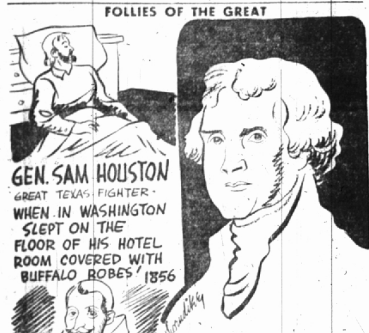
GEN. SAM HOUSTON GREAT TEXAS FIGHTER— WHEN IN WASHINGTON SLEPT ON THE FLOOR OF HIS HOTEL ROOM COVERED WITH BUFFALO ROBES! 1856 THOMAS JEFFERSON WHILE AT THE WHITE HOUSE, RECEIVED FOREIGN DIPLOMATS IN HIS CARPET SLIPPERS! [1632] GUSTAVUS ADOLPHUS II SWEDEN'S GREATEST KING— OPENED THE BATTLE OF LUTZEN WITH THE SINGING OF HYMNS; AS HE AND HIS SOLDIERS FOUGHT BETTER WHEN THEY SANG! [1632]