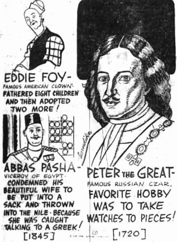
EDDIE FOY—FAMOUS AMERICAN CLOWN—FATHERED EIGHT CHILDREN AND THEN ADOPTED TWO MORE!