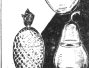
Following the lead of returning 18th century styles in furniture, there is a revival of interest in crystal and fruit designs for glassware.