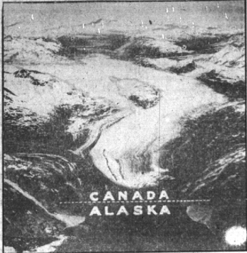
Somewhat of an international immigration problem is Grand Pacific glacier which geologists now discover has crossed the border from Alaska into Canada without benefit of passport. In fact, the glacier has been pretty sneaking about the whole affair, having retreated some 12 miles in 43 years. At the time of the Canada-Alaska border settlement in 1894, Grand Pacific glacier stretched across the boundary line into Alaska. Now its face is 12 miles from the Canadian side, as indicated above.