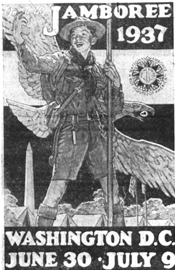
THIS happy Scout portrayed on Norman Rockwell's painting for the official poster of the National Scout Jamboree typifies the spirit of friendship and adventure which will be the lot of 25,000 American boys who will camp with Scouts of other lands on 350 acres at Washington, D. C. Jeanned them by Congress for their Jamboree from June 30 to July 9. In the shadow of the Washington Monument a tented city will be the scene of the greatest demonstration of Scouting ever held in the new world. The national grand review and President Roosevelt's welcome will attract large throngs to the nation's capital. Other principal events include a Convocation at the Washington Monument on the evening of July 4 and a world brotherhood pagant to be held in connection with the closing campfire.

Tell Your Merchant You Saw His Advertisement in THE ECCENTRIC