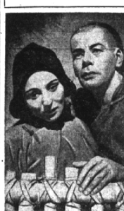
Luise Rainer and Paul Muni in "The Good Earth"

THE dramatic story of China's teeming millions, their struggles, their hardships, and the intensely human heartbeat of the great and little-known nation, is transcribed from Pearl S. Buck's novel to the talking screen in "The Good Earth," starring Paul Muni and Luise Rainer, which opens Sunday evening, April 25th, at the Cass Theatre. It will be shown twice daily thereafter at 2:30 and 8:30 p. m. Tickets are now on sale for all performances of this Metro-Goldwyn-Mayer triumph.