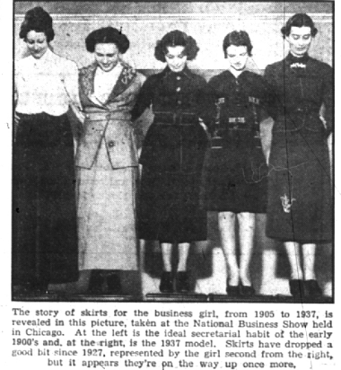
The story of skirts for the business girl, from 1905 to 1937, is revealed in this picture, taken at the National Business Show held in Chicago. At the left is the ideal secretarial habit of the early 1900s and, at the right, is the 1937 model. Skirts have dropped a good bit since 1927, represented by the girl second from the right, but it appears they're on the way up once more.

Jane Withers just dares any kidnaper to come around her house threatening to call the police. Now, in addition to her usual body-guard, a Texas Ranger who looks as if he could roar an army single-handed, her father is usually around, and he has been sworn in as a deputy sheriff, complete with guns.