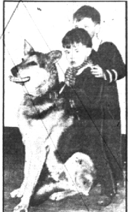
IF DREAMS CAME TRUE FOR TILDEN!