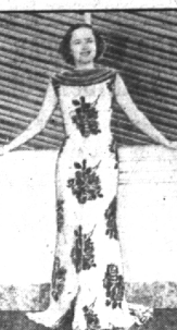
Striking is Olivia de Havilland in this evening gown made of crepe printed in one of the new spring designs so important for the coming season.