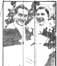
Charles Chaplin and his new bride, Paulette Goddard, are seen here in a scene from their latest picture, 'Modern Times'.

Charles Chaplin, who is well known to Birmingham movie fans as Jock Zeddemerboon, is now in the city on his way to Europe as fast as he could get there.