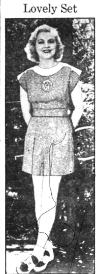
The lovely set becomes a lovely set when the fair tennis player wears an outfit similar to that adorning Claire Trevor, film player. The trim man-made-grained, box-pleated, red and white print shorts are constructed so as to give complete freedom of motion in playing tennis.

Laundry Send Your Family Wash to AXLER'S Theater Bldg. Ph. 1505