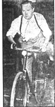
Rep. Martin Zimmerman, Congress auto speed champion, apparently tiring of traffic cops who seem to dole on arresting him, has turned to transportation riding. The unprecedented dog riding is shown cutting a howl dike on a huge dog purchased in New York after returning from his honeymoon in the Virgin Islands.