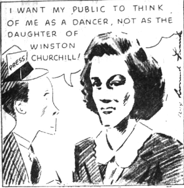
I WANT MY PUBLIC TO THINK OF ME AS A DANCER, NOT AS THE DAUGHTER OF WINSTON CHURCHILL!

Our Reporter interviews a charming dancer to whom publicity means nothing!