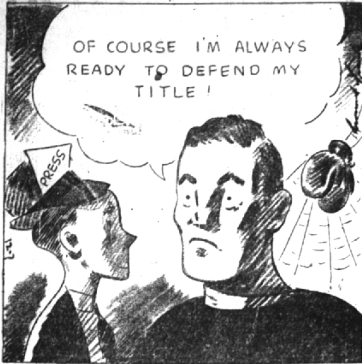
Our Reporter interviews James J. Braddock!