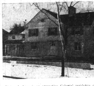
Pictured above is an attractive Colonial residence on Hawthorne Road in Birmingham Park subdivision...