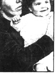
Trades Parents After 17 Years