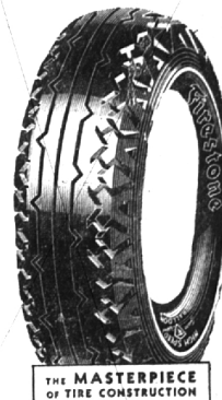
THE MASTERPIECE OF TIRE CONSTRUCTION

Buy Firestone Tires Now! At These Low Prices LIBERAL TRADE-IN ALLOWANCE 3 PAYMENT PLANS TO CHOOSE FROM