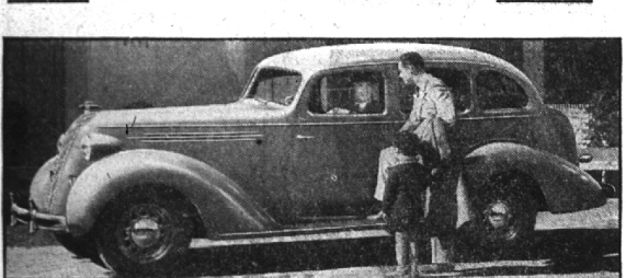
"It's tops' of all the cars I've ever owned."

In our showroom, "owner talk" means more than "sales talk." We're content to let claims take a back seat while owners give you facts. On performance, you needn't take the word of anyone but the man who knows how much easier his Terraplane handles in traffic... how much better it takes straight-aways or curves... how much faster it is on the get-away. His economy figures talk louder than any salesman's claims... even ours! He can tell you facts about Terraplane's long life that would sound boastful if we said them. But even a Terraplane owner can't put into words just what it means to sit at the wheel of this car and drive! With the Electric Hand shifting the gears, your hands stay always on the wheel. Just a flick of the finger... and gears shift! And your foot floor is all clear... Terraplane is the only low priced car with real comfort for three in the front seat... no gear or brake levers to stumble over! Steering is truer. There's an amazing riding smoothness. At the brake pedal, stop stopping than you'll find in any other car, with two braking systems at your command... and still a third from the easiest handling parking brake you ever saw. You ride over the world's first safety engineer's chassis... in a body really all of steel, with solid roof of seamless steel. On every side, something new to discover and enjoy. Stop in now and take this "Discovery Drive" - see for yourself what a change Terraplane has made in motoring.