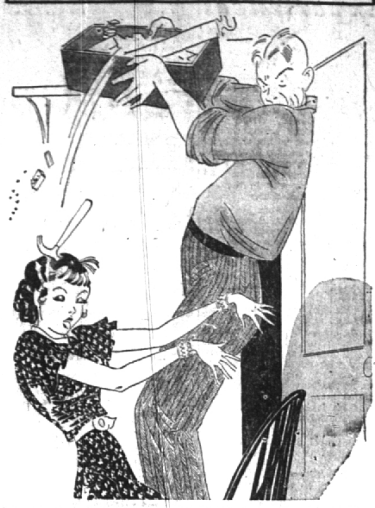
The President of That Union Would Probably Be the Guy Who Accidentally Drops a Hammer on His Wife's Head and Then Shouts at Her for Putting the Tool Box on a High Shelf.