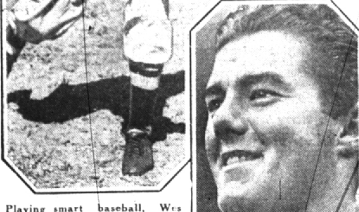
Playing smart baseball, Wes Ferrell, left, late of the Cleveland Indians, is proving himself a big asset to the Red Sox. The nation's crack amateurs will try to wipe that winning smile from the face of Lawson Little, right.

Among the new book the Library has received lately are two mystery murders.