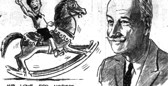
HIS LOVE FOR HORSES CONTINUED AFTER HIS HOBBY HORSE DAYS.