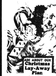
ASK ABOUT OUR Christmas Lay-Away Plan