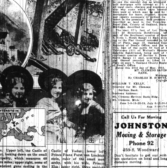
A tip to Liechtenstein acknowledged to be one of the most beautiful scenic countries in the world, as well as the smallest monarchy, will reveal quaint sights as shown above. Upper left, the Castle of Vaduz; lower left, Prince Francis Furst von Liechtenstein, ruler of the small monarchy, with his wife, Princess Elisabeth; lower right, three maidens.