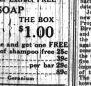
SPECIAL SOAP SALE—3 cakes, Yardley 35c Lavender soap $1.05