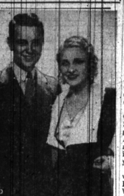
ANOTHER PARTING—Cupid chucks up another loss in Hollywood...

Timely Camera Shots From All Parts of The Globe