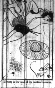
Bobby is the soul of the sultan business.

Several of the telephones have been recovered, some of them with in good condition but others with several parts missing.