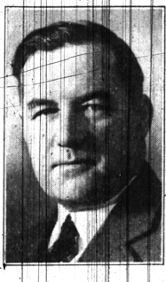
Frank S. Packard