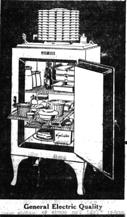
General Electric Quality