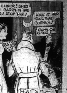
IT'S ENGINE SUES GEAR IT'S ENGINE SUES GEAR IT'S ENGINE SUES GEAR