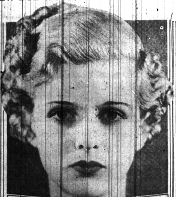
Joan Bennett and her new bob.

A new bob especially becoming to the dainty blonde type of girl is shown here by Joan Bennett. It has been named the 'Riverina'. Above, the hair is shown parted on the left side, over the temple. Below, left, the side view shows the hair curled in poppette curls to give the appearance of waves.