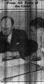
Timely Camera Shots From All Parts of the Globe

(Continued from Page 1) the street where the chap with the... patting and vain attempts... from any and all, and then he... a police call box.