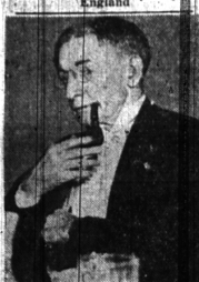
FAMOUS PIPE MISSING —The well-known underslung pipe of Charles G. Dawes appears to have been relegated to the scrap heap. The former ambassador is shown at the Illinois Manufacturers' Association banquet in Chicago.