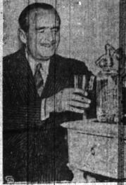
WHEN IN ENGLAND —Douglas Fairbanks, globe-trotting screen star, enjoys a glass of soda and—in his room at his London hotel shortly following his arrival from Indo-China by way of Paris.

Timely Camera Shots From All Parts Of The Globe