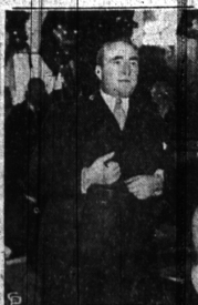
MILLS TESTIFIES —Secretary of the Treasury Ogden Mills has a stormy session before the house ways and means committee at which he predicted a revenue of $128,000,000 to $130,000,000 if beer is legalized.