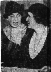
VISITS MRS. ROOSEVELT —Lady Astor, Virginia born member of the British Parliament, chats with the next first lady of the United States in New York, prior to returning to her home in England.