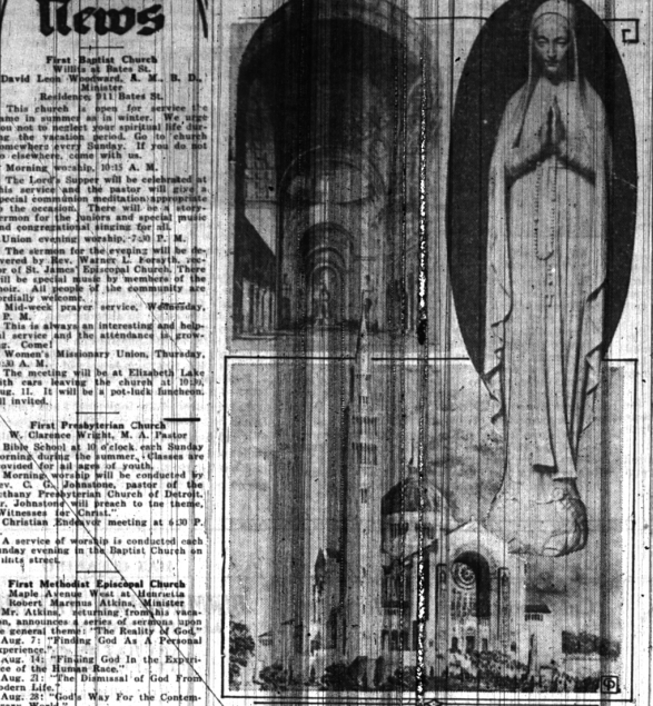
Interior and exterior views of the National Shrine of the Immaculate Conception, Washington, D. C., under construction.

Magnificent Shrine To Mother of Christ Being Erected in Washington