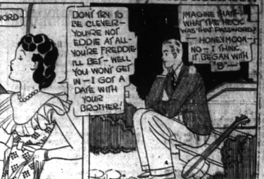
DON'T GO IN TO BE EATEN! YOU'RE NOT EDDIE AT ALL—YOU'RE FREDDIE... YOU GOT A DATE WITH YOUR BROTHER!