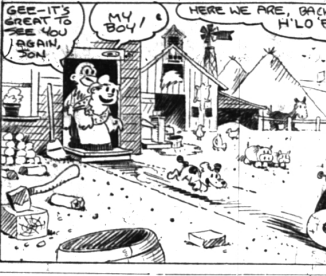
HERE WE ARE, OAK HOME ON THE FARM! MY BOY!