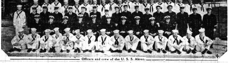
Officers and crew of the U. S. S. Akron.