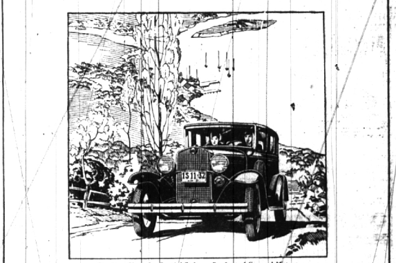
The New Chevrolet Special Sedan—Product of General Motors