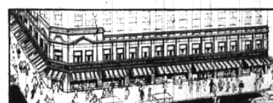
The Briggs-Birmingham Building