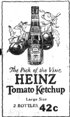
The Pick of the Vine HEINZ Tomato Ketchup Large Size 2 BOTTLES 42c

From Friday Feb. 25 To Thursday Mar. 5 Inclusive