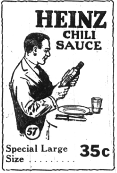
Special Large Size 35c